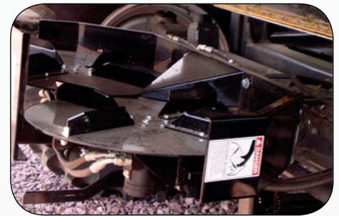
Single and tilting double disc Cyclones are available for all major combines.