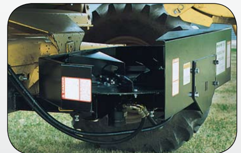
Cyclones come complete with hydraulic motor, hoses, fittings, flow valve and flow pans (where needed).

“I've had no trouble planting without tilling my bean fields.” Dennis D., Elgin, NE