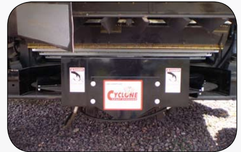
Crary's double disc Cyclone Chaff Spreader